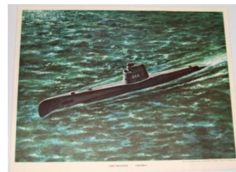
USS Trigger SS-564