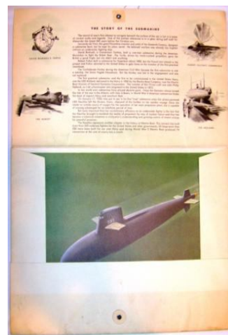
Inside of General Dynamics picture folio.

Our primary site we are considering for the location of the museum is the industrial building on F and 12 th in Marysville. We are estimating that $1,000,000 will be enough to purchase and renovate to the point of being able to open a nice facility. It is large, solid, and was built in 1915 and has about 26,500 sq ft of building